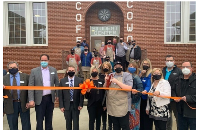
On February 26th, IN WDSTK held a ribbon cutting to celebrate the grand opening of Circle of Friends Coffee Shop at The Circuit. Circle of friends fosters appropriate and supportive employment opportunities for young adults with disabilities.