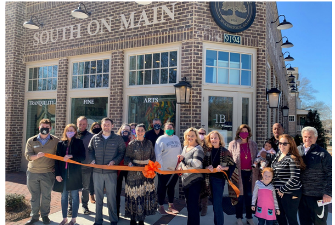
On January 19th, investors in IN WDSTK celebrated the opening of Tranquility Fine Arts in Downtown Woodstock.