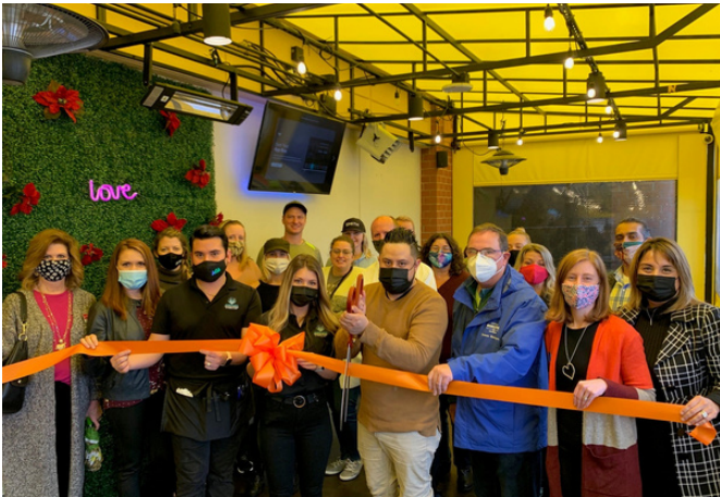
On February 11th, IN WDSTK held a ribbon cutting to celebrate the grand opening of Agave Azul Mexican Kitchen and Tequila Bar located at the Outlet Shoppes at Atlanta.