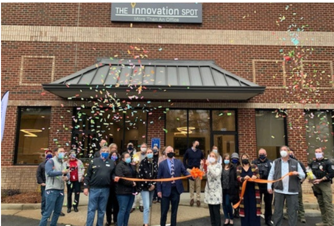
On February 22nd, IN WDSTK held a ribbon cutting to welcome The Innovation Spot to Downtown Woodstock. This co-working solution facility is a great addition to our community.